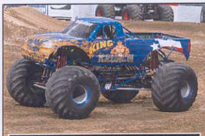
King Krunch Texas Legend