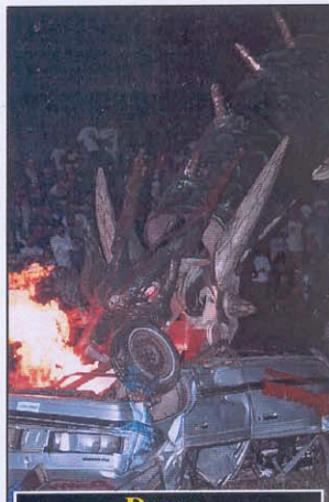
Draco- Fire Breathing Dragon