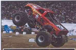
El Matador All New In 2005