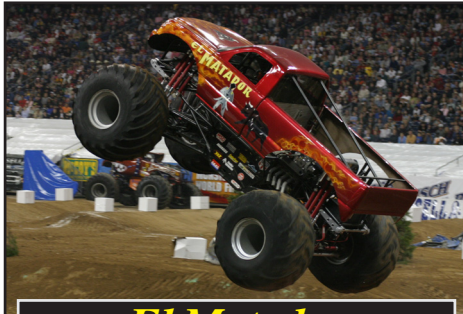
El Matador All New In 2005