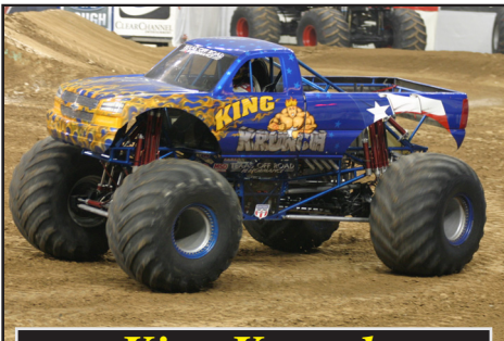
King Krunch Texas Legend

SPORTSDROME SPEEDWAY CHARGE BY PHONE 877-548-3237 www.getquickticks.com