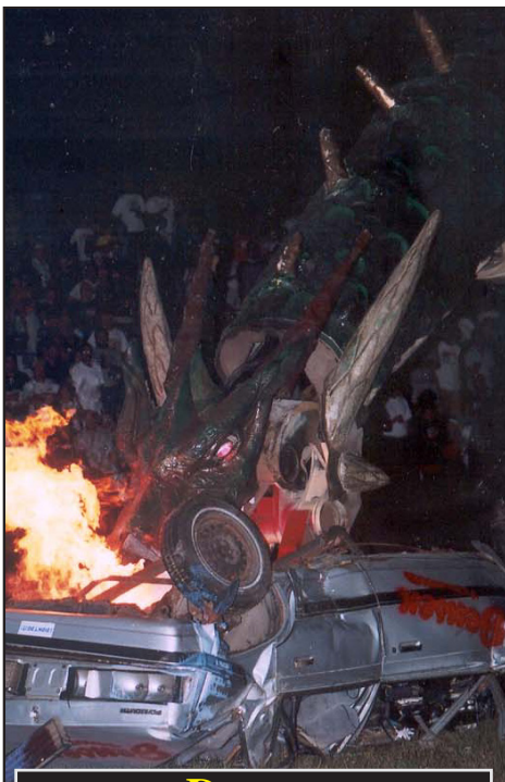
Draco— Fire Breathing Dragon